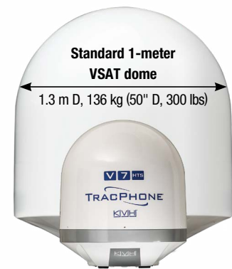
TracPhone V7HTS dome 66.6 cm D, 26.1 kg (26.1" D, 57.6 lbs)

Streamlined belowdecks unit includes: IP-enabled antenna control unit, built-in CommBox Ship/Shore Network Manager, high-throughput modem, Voice over IP adapter, and built-in Wi-Fi and Ethernet switch.