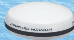
Optional Wireless Access point (SCU-30)