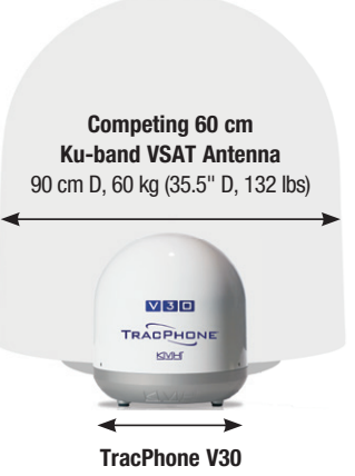
39.4 cm D, 10.6 kg (15.5" D, 23.4 lbs)

With an antenna that is 55% smaller in diameter and 75% lighter than that of leading competing 60 cm VSAT systems, the commercial-grade TracPhone V30 offers higher or comparable data speeds, but is more affordable, and easier and simpler to install.