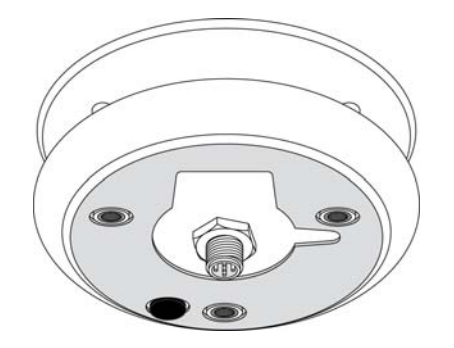
Figure 2 – WSO100 Interface Connector

The Maretron WSO100 provides a connection to an NMEA 2000<sup>®</sup> interface through a connector that can be found on the bottom of the device (see Figure 2).