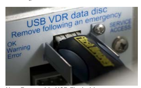
New Removable USB Flash drive

Training tool — The playback function is an excellent tool for crew training. It can be used to set up scenarios showing recordings of best practice navigation.